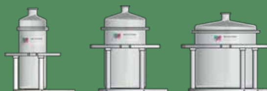
2, 5 and 12-liter glass reactors

EASY EXTRACTION APPROACH TO A FULL TERPENE PROFILE