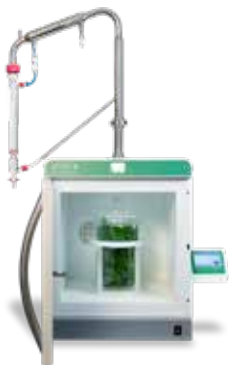
ETHOS X: Microwave Terpene Extraction